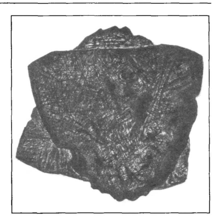
Figure 3. Dendrites in Wootz Steel.

John Verhoeven and the blacksmith Alan Pendray collaborated in the production of modern Damascus blades. Verhoeven has proposed that minute amounts of vanadium were necessary to lead to microsegregation and the formation of banded struc-