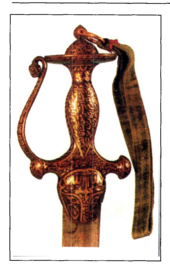
Figure 1. Sword of Tipu Sultan.

this steel was presented to the Western world, scientists in England, France, Russia and Sweden toiled hard and discovered the composition and microstructure and their relation to mechanical properties. This single-minded pursuit of an Eastern technological product by Western scientists for over a century created the foundations of modern materials science. Cyril Stanley Smith has emphasized this theme in his writings. In addition there is a possible connection with nanomaterials and computer modeling. Thus the investigations on wootz steel continue to inspire researchers to this day.