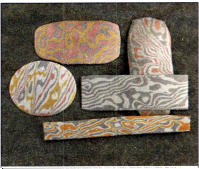
A. Mokumé Gane from Japan