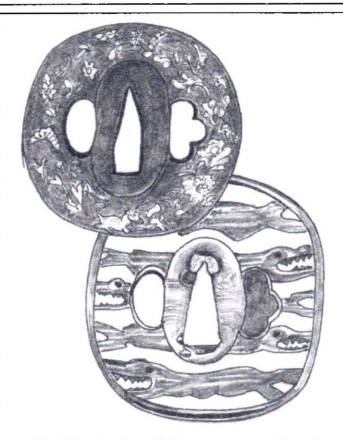
B. Sketch of Japanese tsuba – wrought iron guards for the swords of the Samurai warriors.